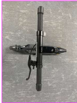
Photo from the top showing the complete handlebar

Photo of the serial number which can be found underneath the scooter on the Pure Advance, Advance+ and Flex scooters